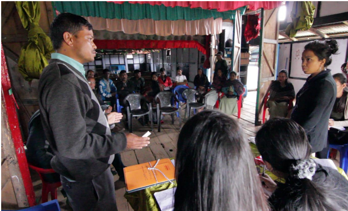
Picture 3.1: Showing Focus group discussion in Sabah Muswang Village