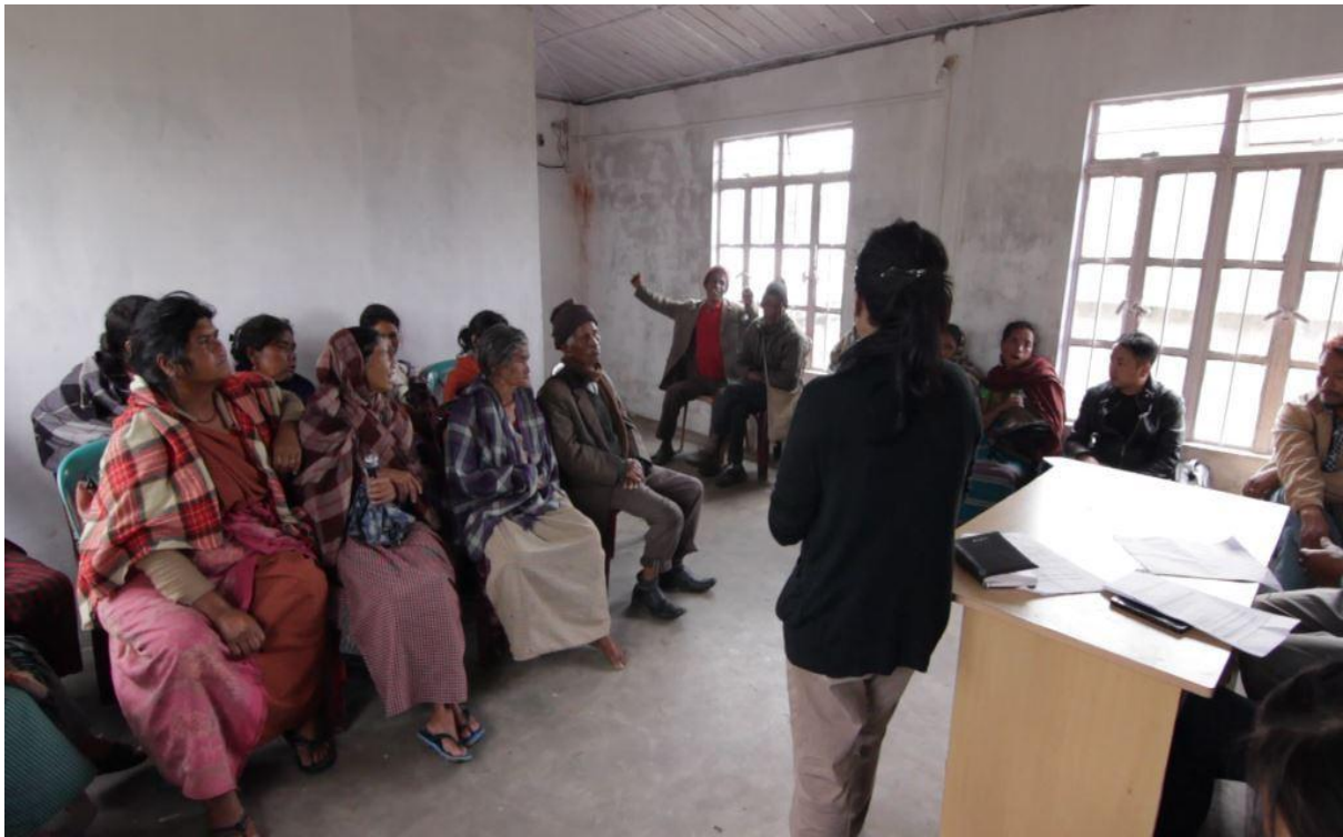
Picture 3.5: Showing Focus group discussion in Tuber Sohshrieh Village